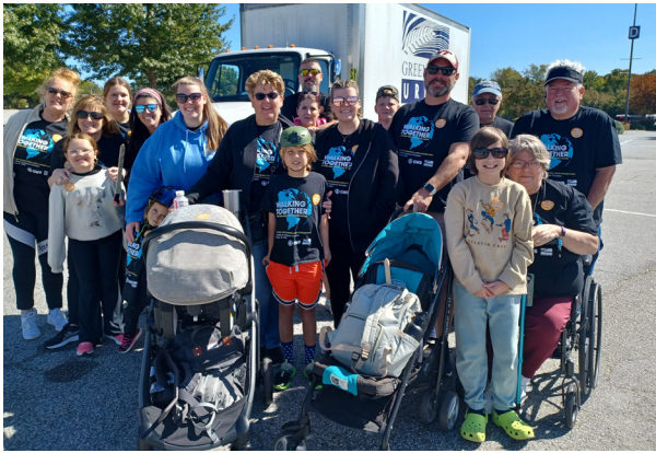
Greensboro Urban Ministry's Potter's House Community Kitchen serves over 300 meals daily to individuals and families